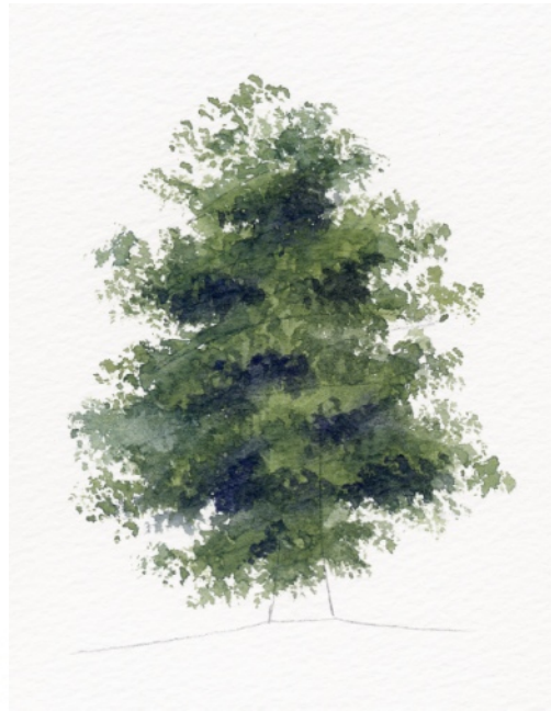
STAGE 3-Add more Foliage

Add the paint in the same way as we sketched in the tree, zigzagging from side to side in a loose manner, use the BRIGHT GREEN to do this, adding the odd drop of the dark grey while the green is wet, this is to give the impression of shadows in the tree.