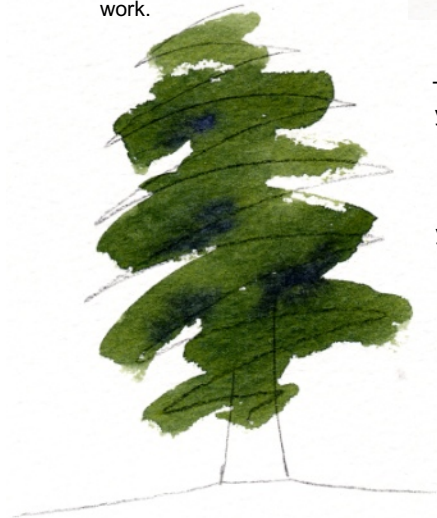
STAGE 2-Begin to Paint

Draw in the basic shape of the tree, use your pencil in a 'ZIGZAG' fashion, going from side to side. Then simply add two lines for the trunk, remember for watercolour painting only a basic sketch is needed. Let the brush do the detail work.