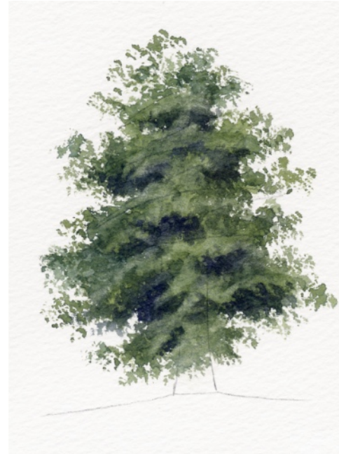
STAGE 4-Add Highlights

The next step is to use the DARK GREEN and your No. 5 brush to add the finer leaves. Push your brush head on in to the mixing palette (where the dark green colour is), allowing the hairs on the brush to separate in to individual sections. Next apply the paint to your paper. Going around the edge of the tree and when dry adding more colour to the centre of the tree, remember to add more shadows with the DARK GREY.